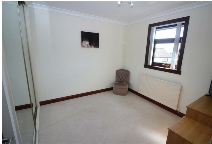
Bedroom 2 13'0" x 7'9" (3.98 x 2.37)