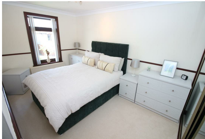
Bedroom 3 10'0" x 7'1" (3.06 x 2.17)