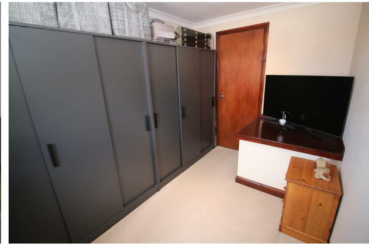
Bedroom 5'11" x 5'10" (1.81 x 1.79)